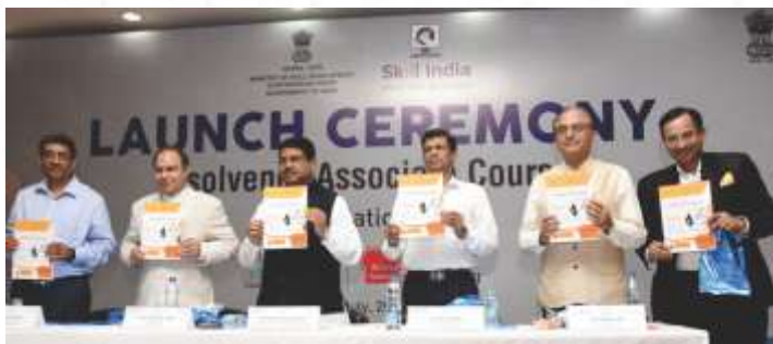
Insolvency Associates Launch Ceremony at New Delhi on 10 th July, 2018