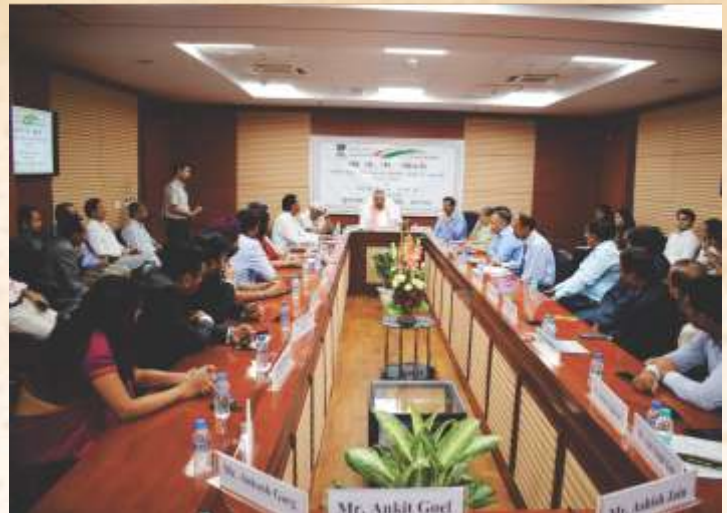
Distribution of Certificates to registered valuers on 19 th July, 2018.