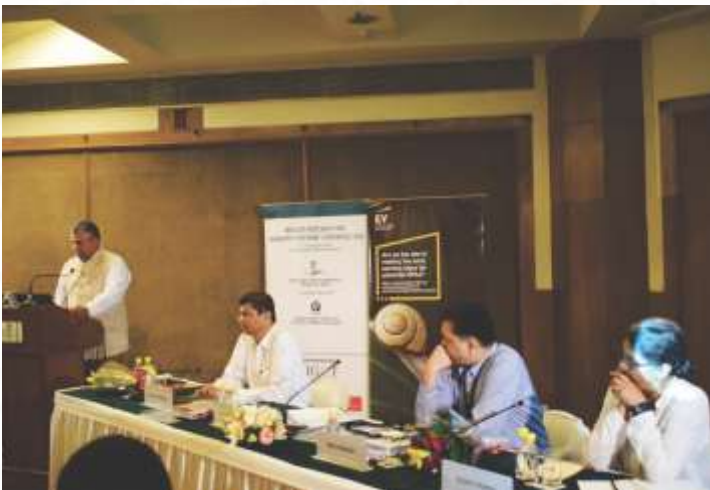
IBBI-IGIDR Conference held at New Delhi on 3 rd - 4 th September, 2018