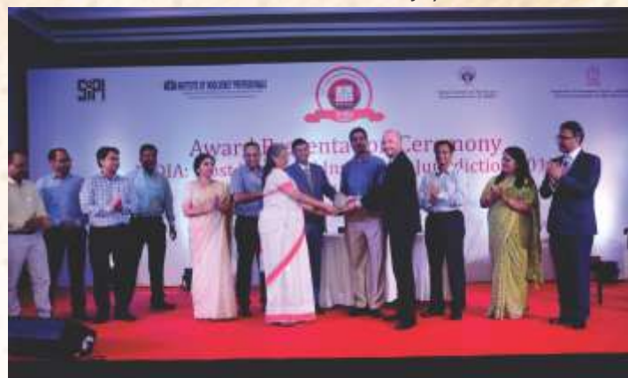
GRR Award Ceremony at New Delhi on 20 th July, 2018