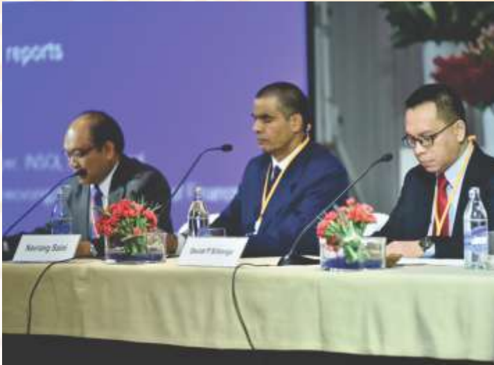
Forum for Asian Insolvency Reform held at Bangkok on 17 th September, 2018