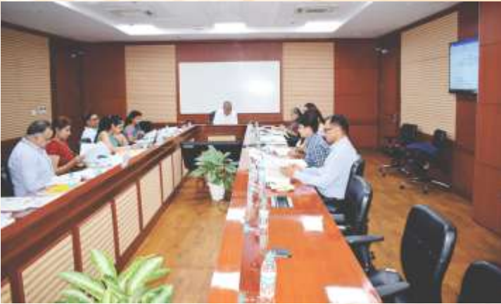
Meeting of the Working Group on Individual Insolvency on 10 th September, 2018