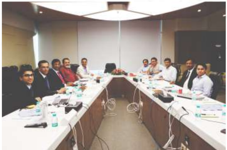
Meeting of the Working Group on Graduate Insolvency Programme on 25 th August, 2018