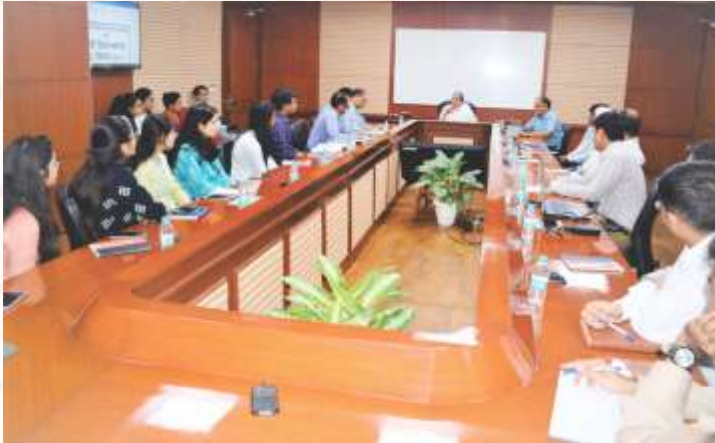
Celebration of Hindi Diwas on 14 th September, 2018

IBBI organised 'Hindi Diwas' on 14 th September, 2018 to celebrate popularity of Hindi as the official language of the Union of India and to promote its use further in official work. The employees participated with great enthusiasm in various activities such as poetry, stories, and songs in Hindi and won prizes.