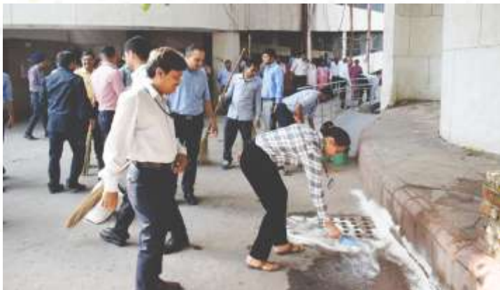
Shramdaan Activity on 28 th September, 2018

IBBI organised Shramdaan Activity on 28 th September, 2018 to accelerate momentum of Jan-andolan for realising Hon'ble Prime Minister's vision of clean India under 'Swachhata Hi Seva' programme observed from 15 th September to 2 nd October, 2018.