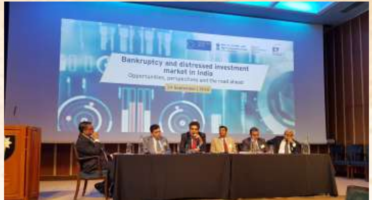
Seminar on 'Distressed Assets Market in India' at London on 24 th September, 2018

and participated in a panel discussion on 'regulatory framework relating to insolvency, distressed assets and foreign investments'.