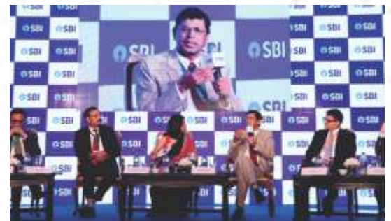
5 th SBI Banking and Economic Conclave, 2018 at Mumbai on 4 th July, 2018

Prepared by the Research Division of the Insolvency and Bankruptcy Board of India (7 th Floor, Mayur Bhawan, Shankar Market, Connaught Place, New Delhi 110 001). Suggestions, if any, may be mailed to research@ibbi.gov.in