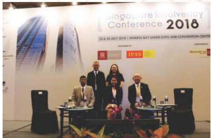
Singapore Insolvency Conference held at Singapore on 23 rd July, 2018