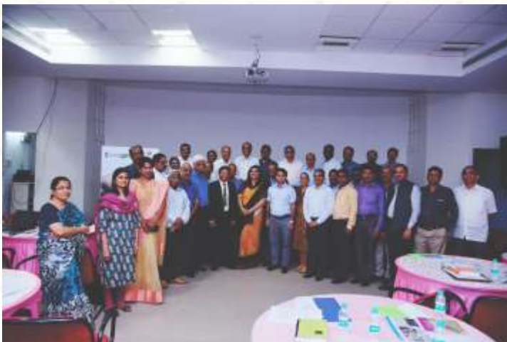
10 th IP Workshop at Hyderabad on 7 th - 8 th September, 2018

IBBI has been organising two-day workshop for newly registered IPs with a view to build their capacity. During the quarter, IBBI organised one workshop, 10 th in the series, on 7 th -8 th September, 2018 at Hyderabad. 34 IPs attended the workshop.