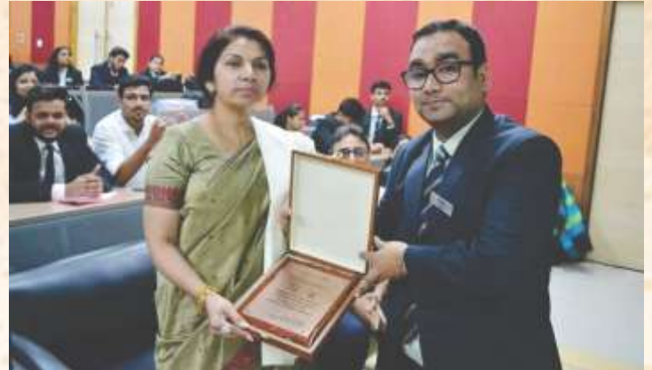
Moot competition by University of Petroleum and Energy Studies, Dehradun on 30 th September, 2018