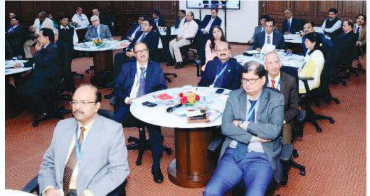
Workshop on "Committee of Creditors: An Institution of Public Faith" on 15 th and 16 th February, 2019

The IBBI, jointly with the State Bank of India and the Indian Institute of Corporate Affairs, organised a two-day workshop on "Committee of Creditors: An Institution of Public Faith" on 15 th - 16 th February, 2019 in Mumbai. The workshop was unique and first of its kind for the benefit of the FCs. 28 senior officers (General Managers and Executive Directors) of major scheduled commercial banks participated in the workshop.