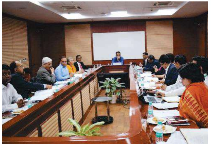
Meeting of Advisory Committee on Service Providers on 14 th March, 2019