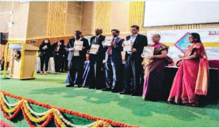
International Conference in Hyderabad on 1 st to 3 rd March, 2019