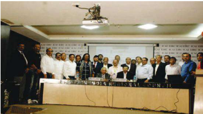
14 th Workshop for IPs in Kolkata on 8 th - 9 th March, 2019