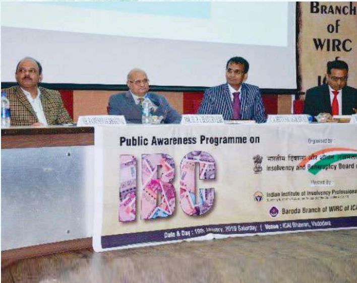
Awareness Programme in Vadodara on 19 th January, 2019