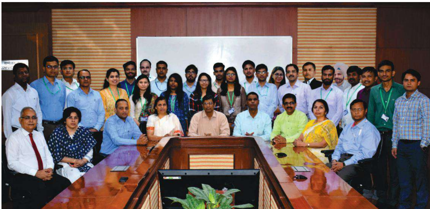
Chairperson, Whole Time Members and Officers as on 31 st March, 2019