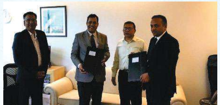
IBBI signs MoU with SEBI on 19 th March, 2019

It envisages (a) sharing of information and resources, (b) periodic meetings to discuss matters of mutual interest, (c) cross-training of staff, (d) capacity building of IPs and FCs, and (e) enhancing level of awareness among FCs.