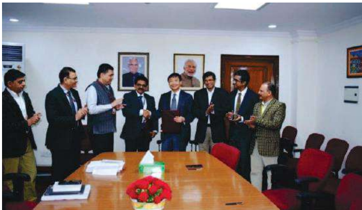
IBBI signs Cooperation Agreement with IFC on 6 th March, 2019