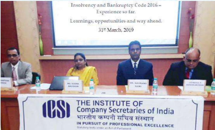
Insolvency and Bankruptcy Code, 2016 – Experience so far: Learnings, opportunities and way ahead held on 31 st March, 2019