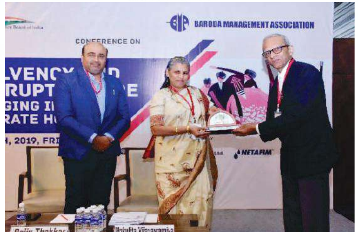
IBBI – BMA Conference in Baroda on 8 th March, 2019

In association with IBBI, the Baroda Management Association organised a conference on Insolvency and Bankruptcy Code in Baroda on 8 th March, 2019 on the theme “Changing Indian Corporate Horizon”. Distinguished professionals participated in this conference.