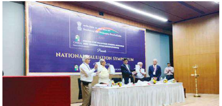
National Valuation Symposium in Ahmedabad on 23 rd February, 2019