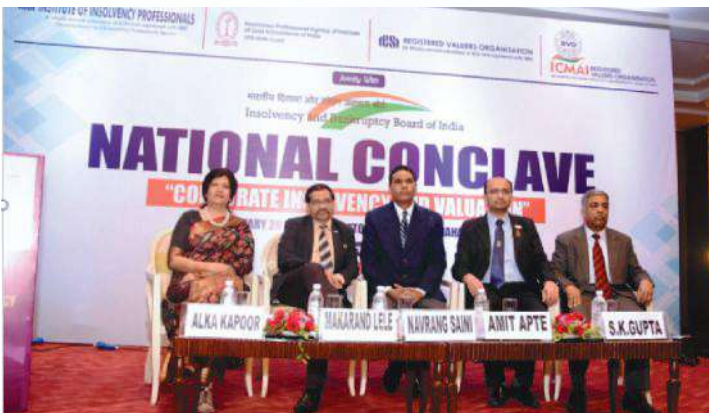
National Conclave on Valuation in Pune on 8 th January, 2019