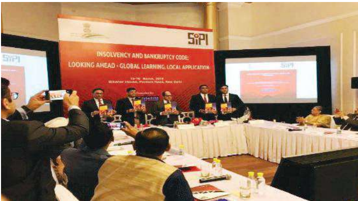
IBBI- SiPI Roundtable, 15 th March 2019