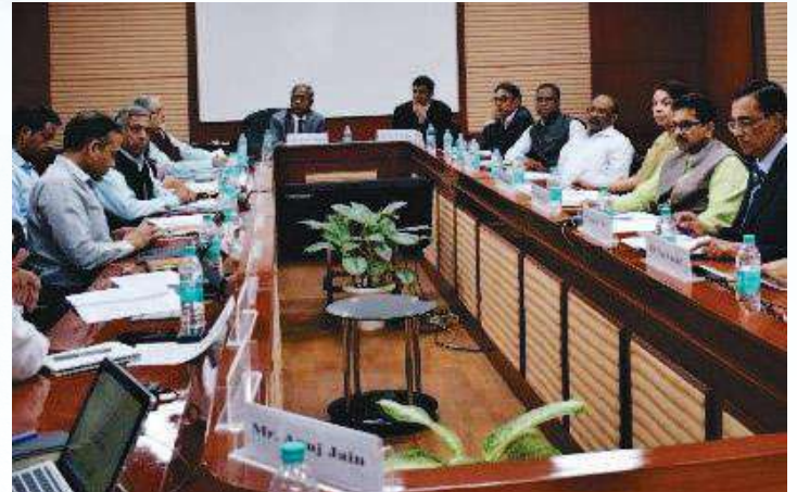
Meeting of the Working Group on Group Insolvency on 26 th March, 2019