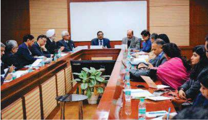
Roundtable on Liquidation in Delhi on 27 th February, 2019