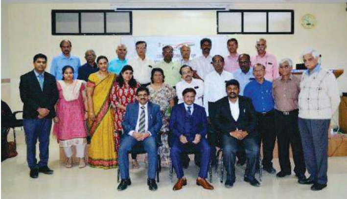
13 th Workshop for IPs in Coimbatore on 1 st - 2 nd February, 2019

IBBI has been organising two-day workshops for the newly registered IPs, with a view to build their capacity. During the quarter, IBBI organised two such workshops, the 13 th and 14 th in the series. The 13 th workshop with 23 IPs was held on 1 st - 2 nd February, 2019 at Coimbatore. The 14 th workshop with 27 IPs was held on 8 th - 9 th March, 2019 at Kolkata.