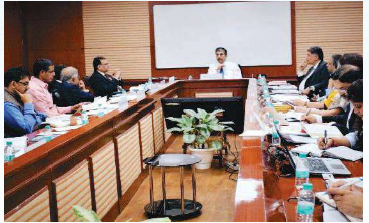
Advisory Committee meeting on Corporate Insolvency and Liquidation on 19 th March, 2019

The Technical Committee on IUs met on 5 th March, 2019. The Advisory Committee on Service Providers met on 14 th March, 2019. The Advisory Committee on Corporate Insolvency and Liquidation met on 19 th March, 2019. They deliberated various issues relating to processes and services under the Code.