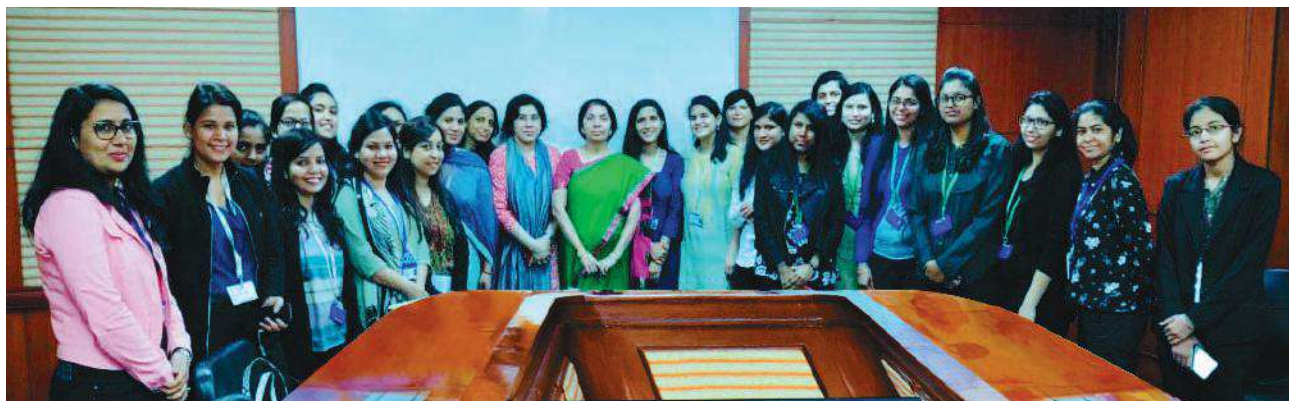
Women's Day, 8 th March, 2019

-Hon'ble Finance and Corporate Affairs Minister on 'Two Years of Insolvency and Bankruptcy Code (IBC)', Facebook, 3 rd January, 2019