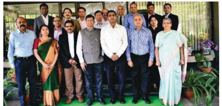
At Strategy Meet in Gurugram on 22 nd -23 rd March, 2019

The IBBI organises an annual Strategy Meet for formulating a strategic action plan to guide its efforts and resources towards its objectives. Senior officers participated in the third strategy meet on 22 nd and 23 rd March, 2019 at The Energy and Resources Institute RETREAT in Gurugram to formulate the Strategic Action Plan for 2019-20 that outlines its objectives, strategies, specific actions and tasks.